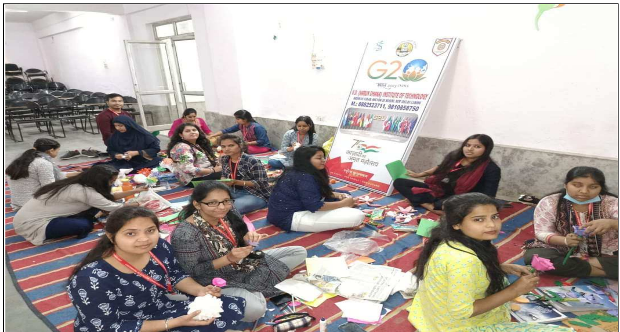
Fig 2 : B.Ed first Semester and fourth Semester students participating in G-20 Activity: flower making competition