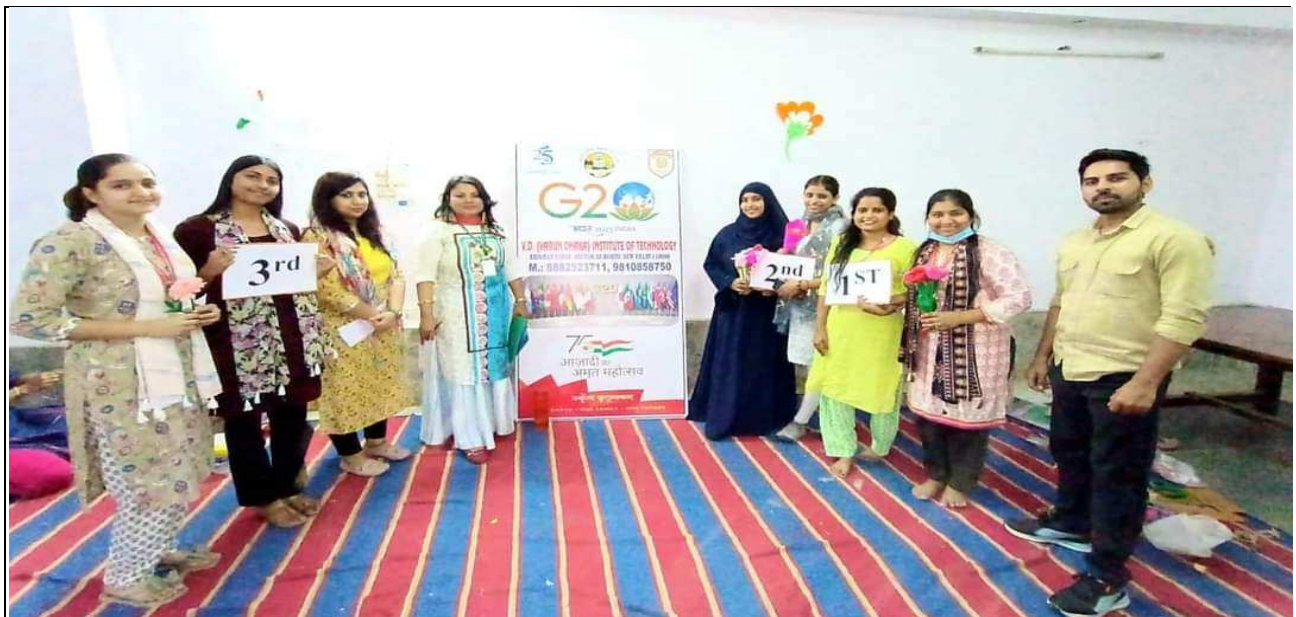
Fig. 4 Winners of G-20 Activity: flower making competition