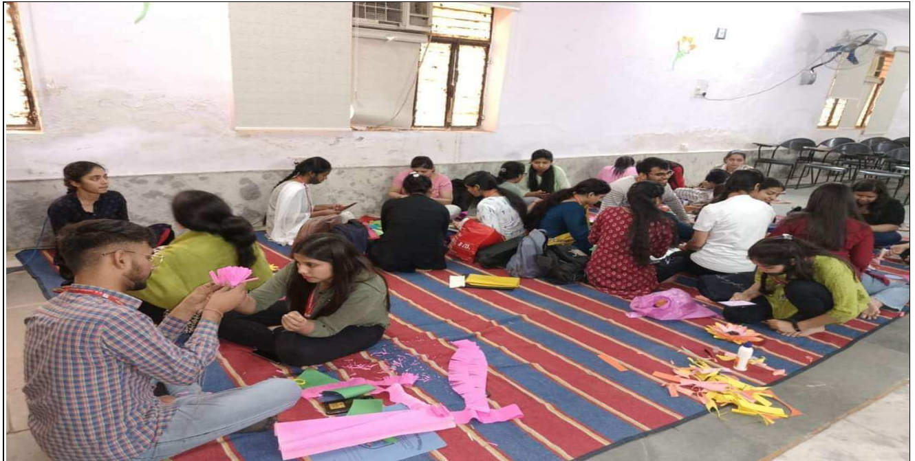
Fig 3 : B.Ed first Semester and fourth Semester students participating in G-20 Activity: flower making competition